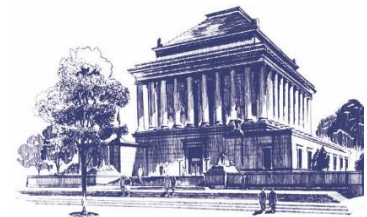
HOUSE OF THE TEMPLE, HEADQUARTERS FOR THE SCOTTISH RITE, SOUTHERN JURISDICTION, USA